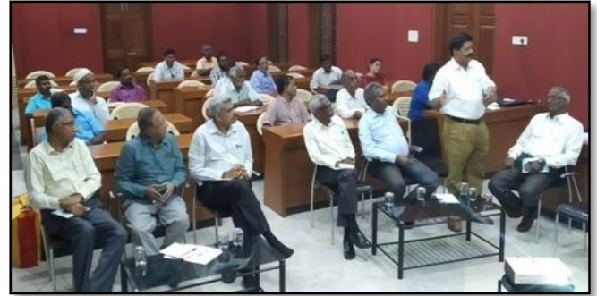
Snapshot of Technical Textiles Phase II programme

The Technical textiles phase II programme was held on 27.02.2019 and participants presented their ideas on “Product development in Technical textiles”.