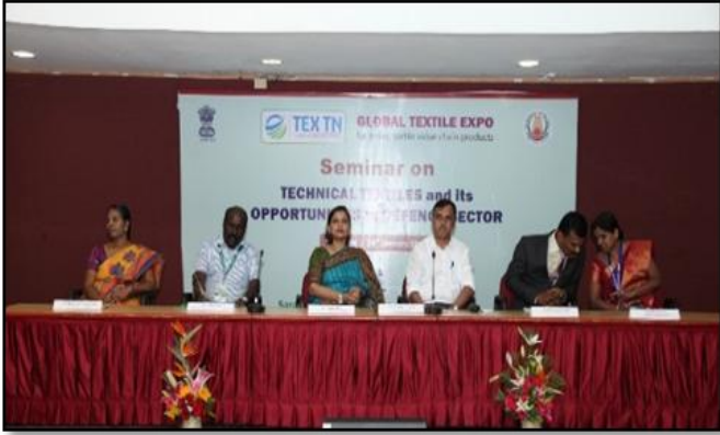
Snapshot of Seminar on “Technical Textiles and its Opportunities in Defence Sector”