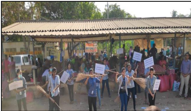
Snapshots of Swachhta Pakhwada - "Flash Mob" Event