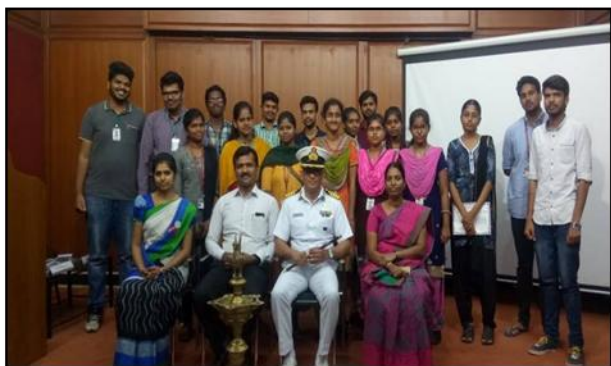
Snapshot of Swachhta Pakhwada – "Project Mr. Clean" Event