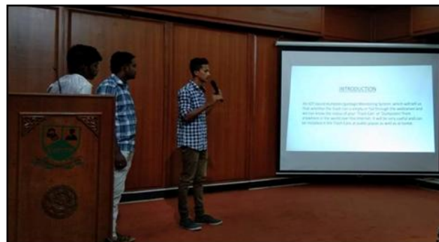
Snapshot of Swachhta Pakhwada - "Digitization of Waste Management" Presentation by students

The IT Club of SVPITM organized the third event, an inter-collegiate event on " Digitization of Waste Management " held on 07.03.2019, where students presented their ideas on developing " Application Software for Waste Management ".