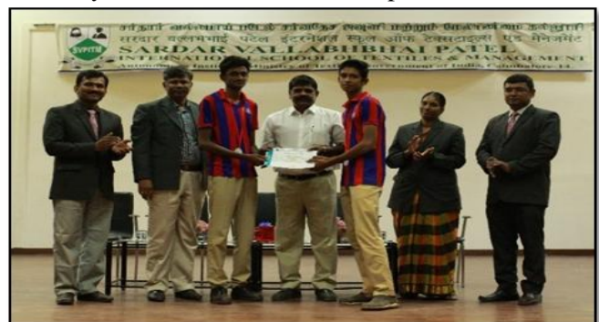
InQuizitive'2019, an Interschool Quiz competition held at SVPITM on 23.01.2019