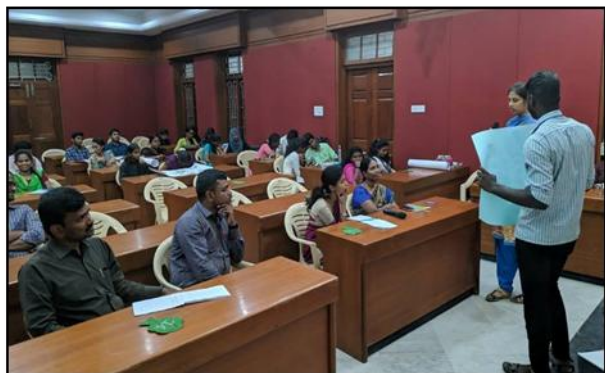
Snapshot of Swachhta Pakhwada - "Bio Degradable Packing Alternative" Poster Presentation

The second Swachhta Pakhwada event was organized by Eco-Club , an inter-collegiate competition on " Poster Presentation " which was held on 05.03.2019. The theme of the presentation was " Bio Degradable Packing Alternative ".