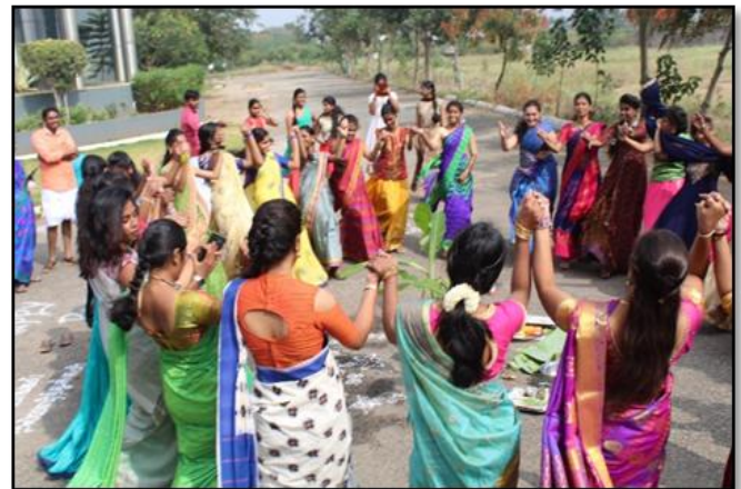
Snapshot of Pongal Vizha

Pongal Vizha was celebrated at the Institute Premises on 12.01.2019. It was organized by the Maanavar Muthamizh Mandram. Various Competitions like கோலப்போட்டி (Rangoli), பொங்கல் வைத்தல் (Pongal Preparation), உரி அடித்தல் (Pot breaking with blindfold)) were held among the Faculty/Students on that day.