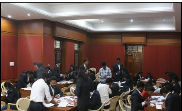
Snapshot of Value Added Program – "Business Simulation Games"