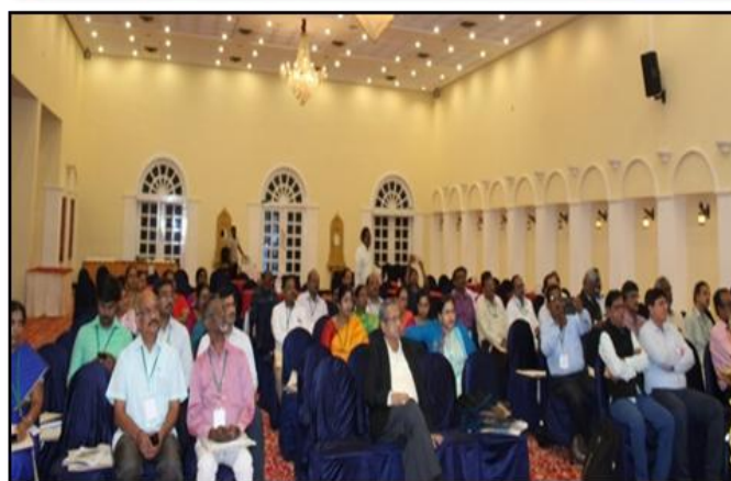
Snapshot of Geosynthetics Seminar