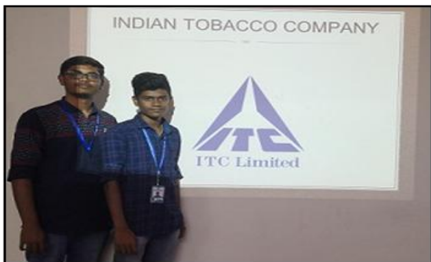
Snapshot of Intra-collegiate presentation competition “Surmount 2019”

On 06.02.2019, the Idea Club of SVPITM organized an Intra-collegiate presentation competition “ Surmount 2019 ” where students presented the startup stories of successful companies / brands.