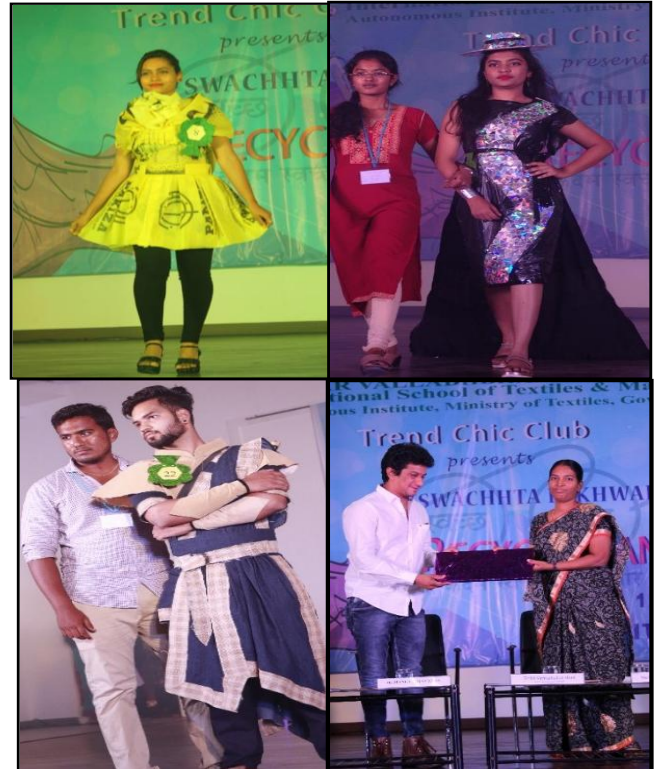
Snapshots of Swachhta Pakhwada – "Recyclomania 2K19" Event

On 13.03.2019, the Fashion Club of SVPITM organized a National level inter-collegiate Designer Contest - " Recyclomania 2K19 " as part of Swachhta Pakhwada where students from various colleges showcased their garments made out of waste materials.