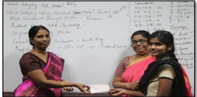
Snapshot of Value Added Program on "SPSS & EXCEL Proficiency"