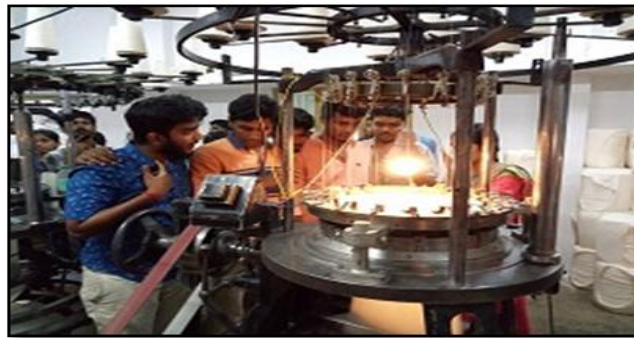
Snapshots of Industry Visits