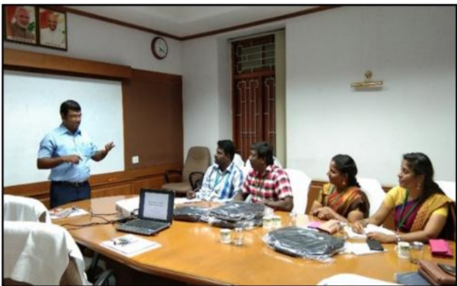
Snapshot of Training for Assistant Managers of Handlooms Department

The Department of Handlooms and Textiles, Government of Tamil Nadu organized a “Higher Diploma in Cooperative Management” for the newly recruited Assistant Directors of the department. As part of it, a four day Training Programme (01.02.2019, 04.02.2019, 26.02.2019, 27.02.2019) was organized by SVPITM where the trainees were given awareness on some basic concepts of Textiles and Management.