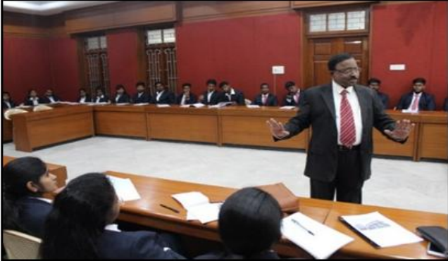
Snapshot of Value Added Program on "Business Model Canvass"

The Management Association of SVPITM, "UPAGRAHA" is vibrantly organizing value Added Programs, Industry Connect Initiatives, Workshops and Training Programs which nurtured and motivated the MBA students to equip essential skill sets as per the current industrial requirements and gave them a platform to take up responsibilities in organizing various events and benefiting from them.