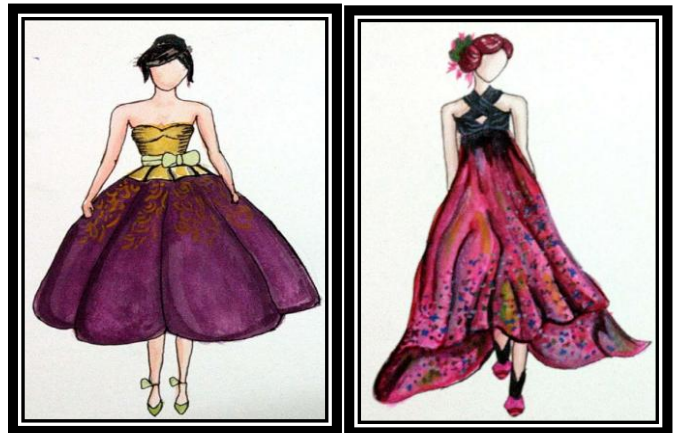
Sketches by Poornima. M of I B.Sc